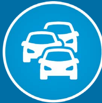
Crowding & Traffic Relief