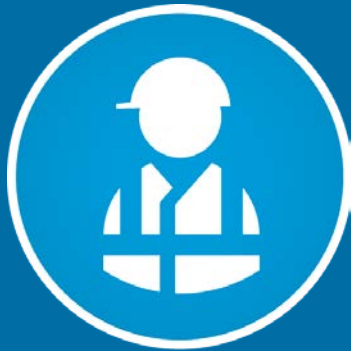
Safety & Reliability